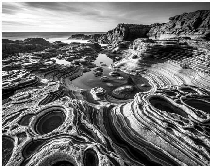
Figure 1. Illustration of infinite complexity in a coastline, presented as a classic example of a fractal structure in nature (Mandelbrot 1983).