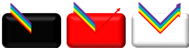
Figure 1. How objects with different color reflect incident white light

Newton also provided the first systematic explanation that the color of objects depends on their interaction with incident white light (Figure 1). Each object absorbs certain rays and reflects others, the latter constituting the perceived color (Newton 1704, 135). This account shifted the understanding of color from being a property of object surfaces to being a property of light itself.