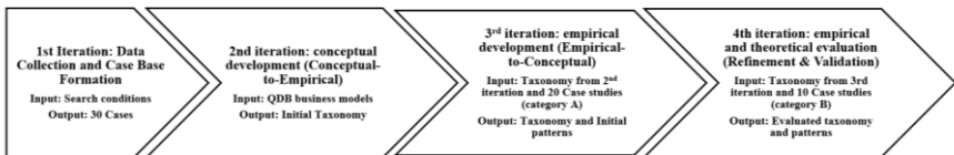
Figure 1. Framework for Business Model Pattern Classification Development Based on Nickerson et al. (2013)

This study was designed using the iterative approach proposed by Nickerson et al. (2013) and was conducted through four consecutive cycles. Figure 1 provides a summary of the iterative cycles presented in this study. The following section presents the four iterations of this study.